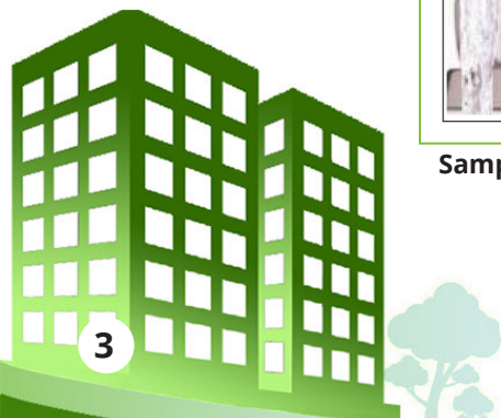
Sample Directory Ad